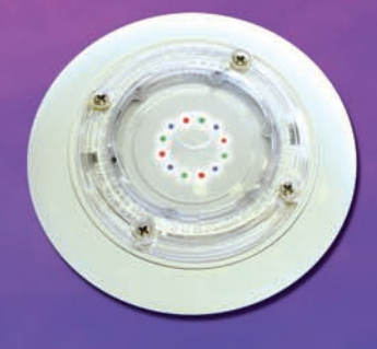
Specializing in Pool Lights for over 20 years!